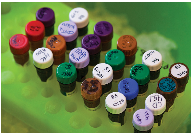
Large biobanks, combined with Sweden's demographic databases, provide unique resources for analysis.