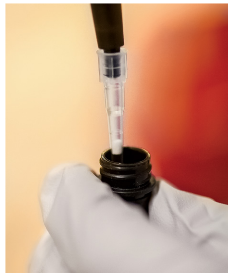
Sidinh Luc studies how stem cells differ from each other.